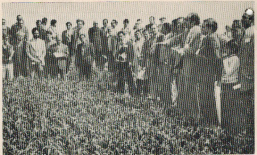
Our M.D. explaining some points to the visitors.